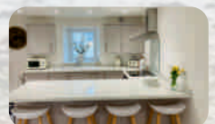
Lloydia, Seven Guest, two Bathroom apartment